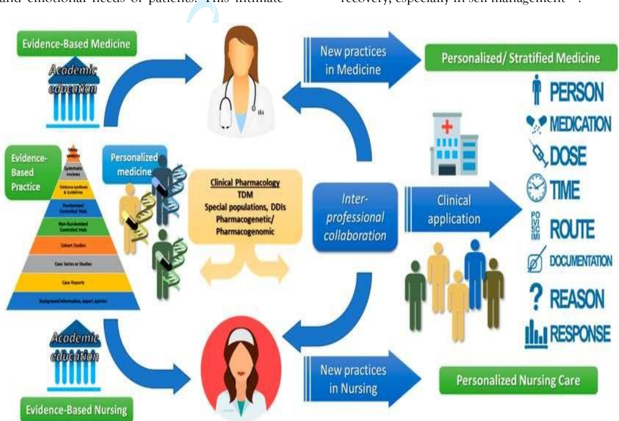
Figure 1.1: The role of nursing personnel (NP) in utilizing knowledge and interpreting instructions derived from treating physicians in clinical settings toward personalized medicine and nursing care.

contact puts nurses in a unique position to help improve a patient's outcome and make a significant contribution to the healing process [4] . Over the last 100 years, the profession of nursing has undergone significant change [5] . Nurses serve as the link between professionals and families to ensure effective communication between physicians, therapists, pharmacists, patients and families. By communicating effectively and collaborating with others, nurses can help to minimize the risk of medical errors, decrease delays in treatment and enhance the overall patient experience [6] . Nurses can educate patients and their families and teach them to be active members of the health care team and to become effective decision makers [7] . For chronic conditions like diabetes, hypertension, cardiovascular diseases, and respiratory disorders, this educational role is especially critical because it plays a pivotal role in treatment outcomes and recovery, especially in self-management [8] .